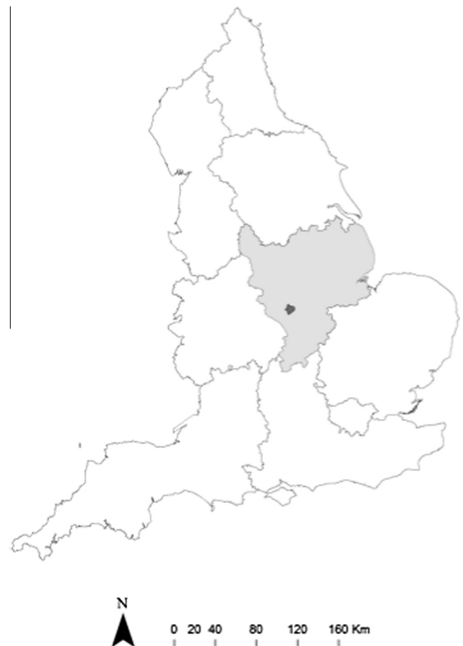
Fig. 1. The East Midlands (shaded grey) and Leicester (shaded black) within England.

The analysis described here used data drawn from the 4 M multi-stage household study [12]. An initial household questionnaire was developed for delivery by an independent social research institute, The National Centre for Social Research (Natcen), using a face-to-face computer-assisted interview format. Questions were designed to collect details about the usage of private (individual/shared) and company cars, home energy use, garden management practices, type of dwelling (e.g. semi-detached, terraced), socio-demographics (e.g. gender, income, occupation) and household composition (e.g. number of people residing in household, age of household members). Additional consent was sought for acquiring