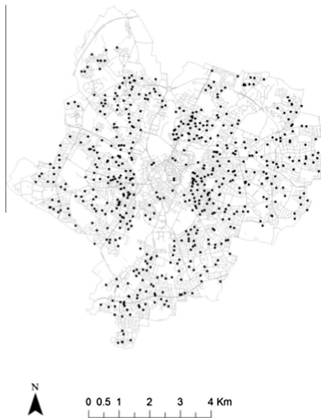
Fig. 2. The approximate location (The location of each house has been randomly perturbed by +/- 100 m in each direction to maintain the anonymity of the participants) of the 575 households within the Unitary Authority Boundary of Leicester and the major road network within the city (52°38'N, 1°08'W).

The meter readings provided an estimate of gas usage for 313 households, of which 11 did not use gas (i.e. zero consumption),